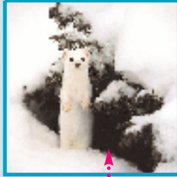
A stoat in its winter coat